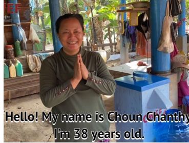
Chantry, a recent recipient of a Biosand Water Filter from CWEF