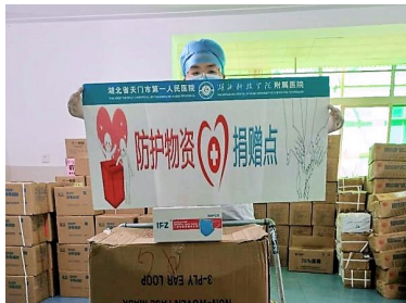
Medical workers in Hubei province receive donation of masks from CWEF