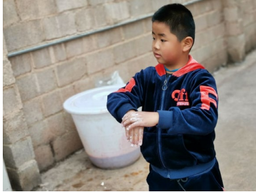
A member of our HEAL health training, learning how to properly wash hands