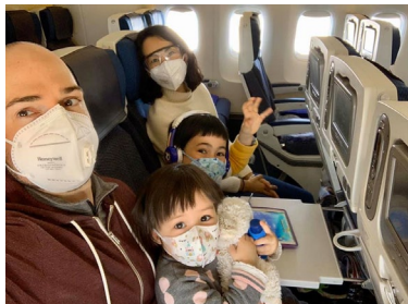
On our way from Asia to the U.S. in early February